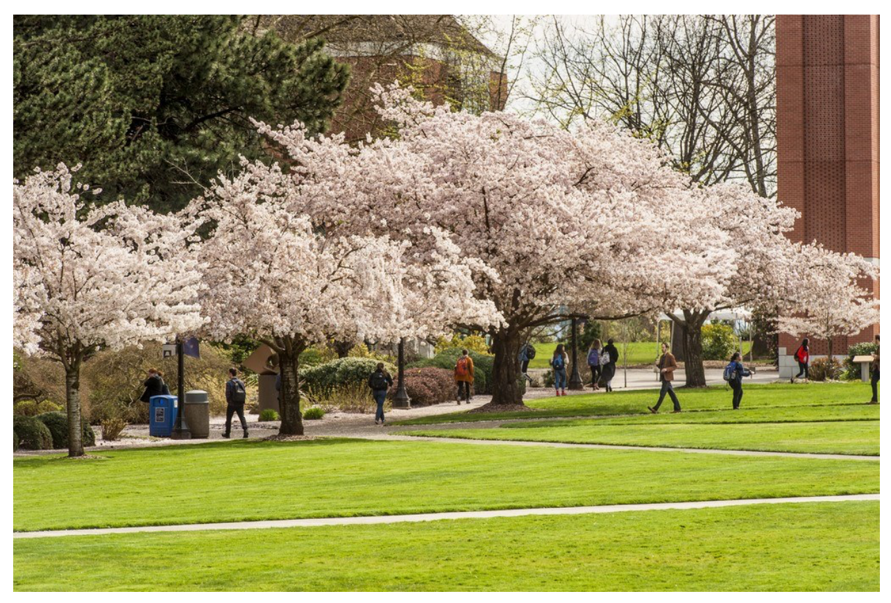
February 2023 Pol Newsletter